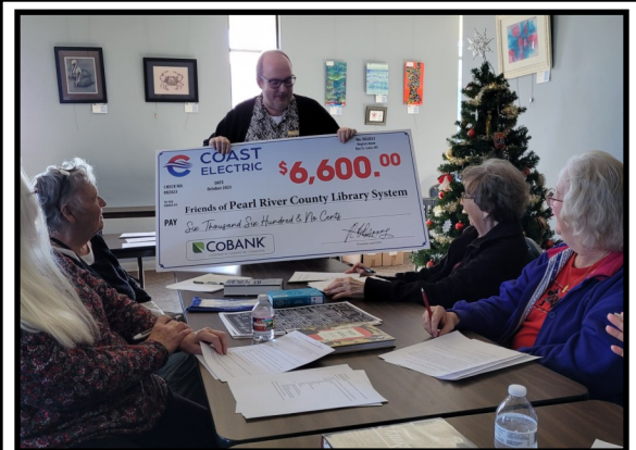
In October, Coast Electric presented a grant of $6,600 to the Friends of the Library!

Would you like to enjoy a fun afternoon while helping a great cause? Join us for our fundraiser, "Tea with Friends", on Sunday, June 23rd at 2pm at the Crosby Library. Tickets will go on sale in May for $30, or $25 for members of the Friends of the Library. There'll be food, fun and a silent auction, too!